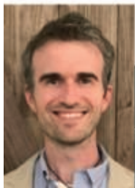
TALKS BY PATRICK O'HEARN AUTHOR OF COURTSHIP OF THE SAINTS